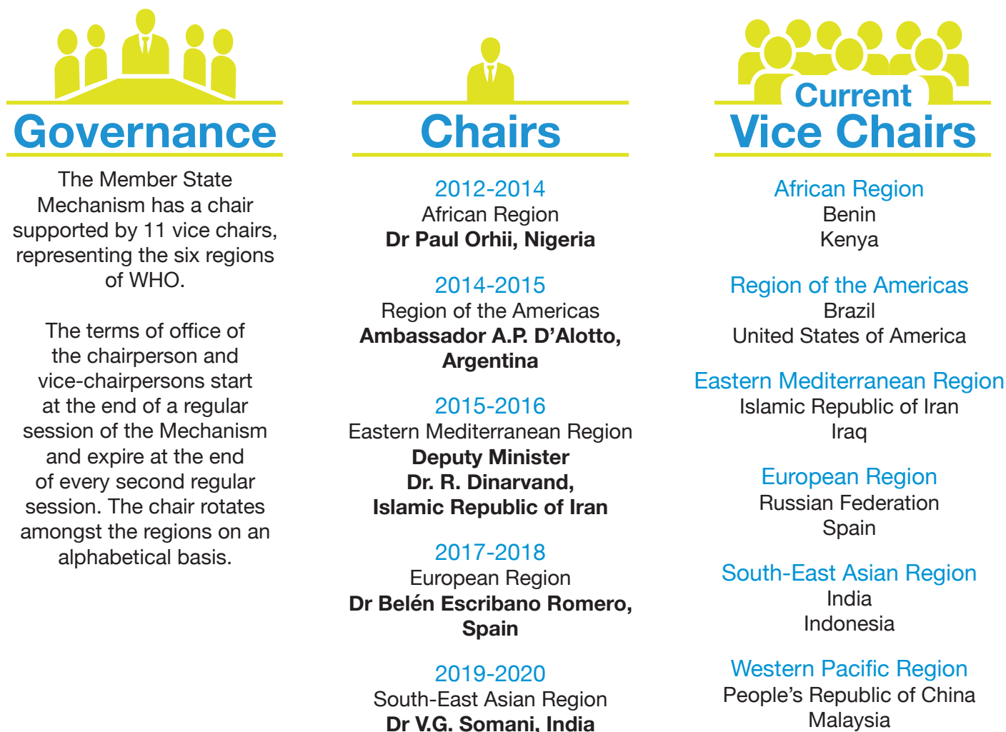
Figure 2. Structure and governance of the Member State Mechanism

The terms of reference of the Member State Mechanism are framed from a public health perspective and expressly exclude the protection of intellectual property rights from their mandate.